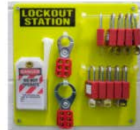
Examples of LOTO devices