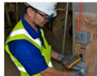
Worker testing a circuit to ensure that it is de-energized